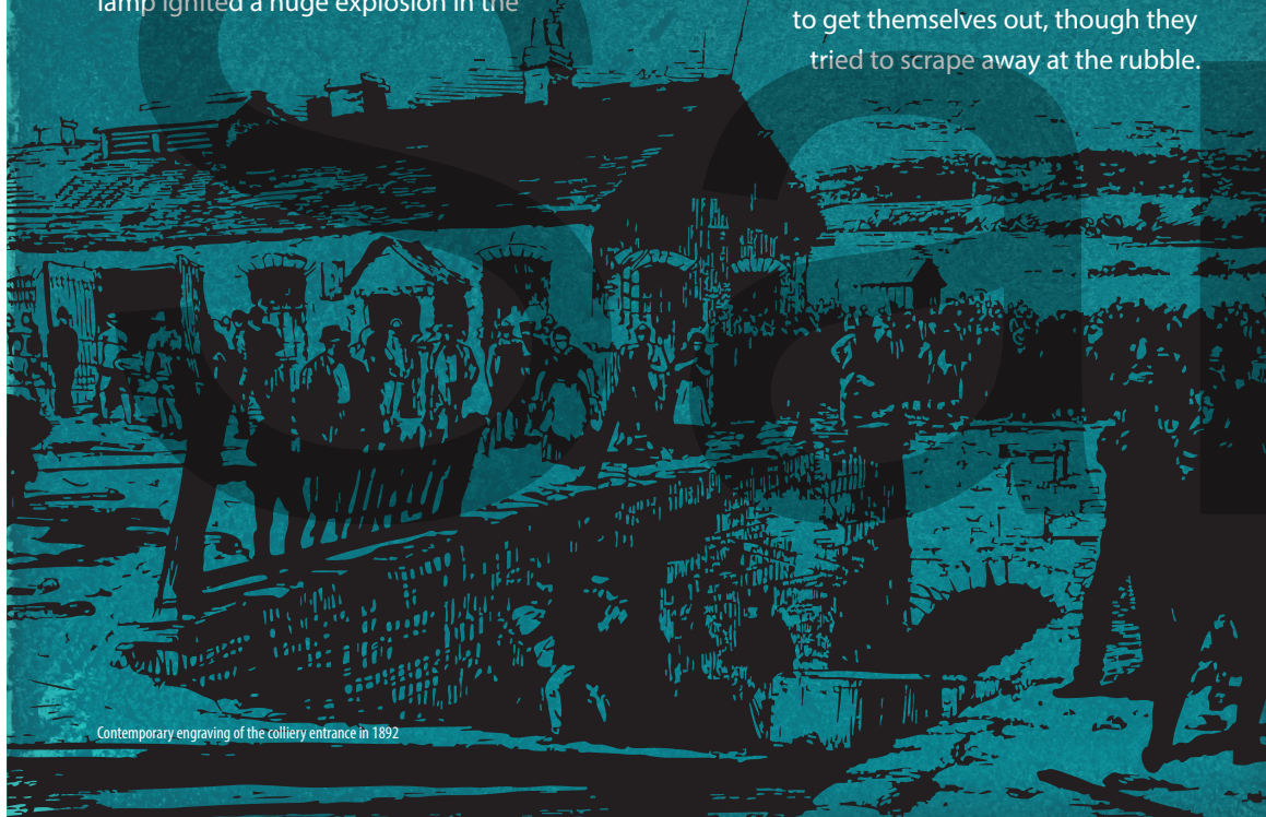
Contemporary engraving of the colliery entrance in 1892