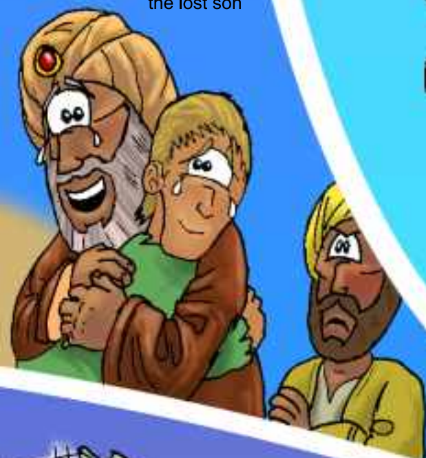
Parable of the lost son